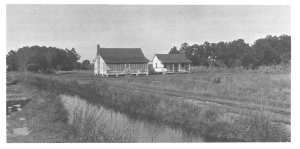
Drainage ditches and canals divide the agricultural fields and flat plains of Lake Landing in Hyde County, North Carolina. Implemented in the 19th century, this system made possible water transportation and the farming of swampy lowlands. Coastal plain cottages represent the common housing stock of the region. (J. Timothy Keller)